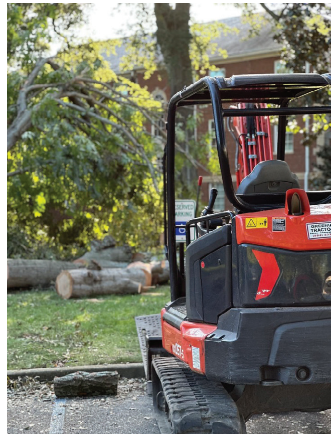
Hurricane Melissa recently brought devastation to Jamaica. Last fall, Hurricane Helene made its way through Wofford's campus.

The support organizations and universities have shown Western NC should apply to the Hurricane Melissa victims as well.