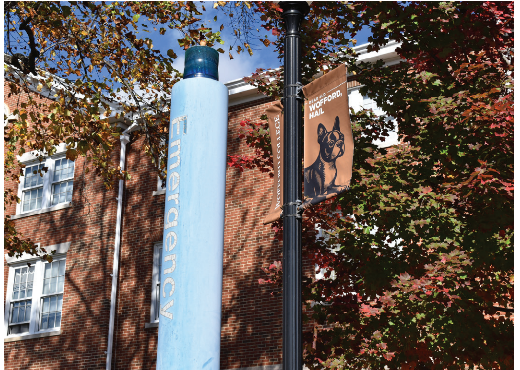
Security around campus at Wofford consists of cameras and Campus Police; is that enough?

parking lots, especially in the parking lot behind the Rosalind Sallenger Richardson Center for the Arts and Memorial Drive directly behind it where cameras do not sufficiently survey the entire area.