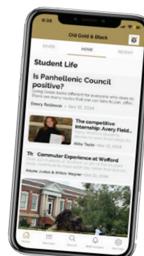
College News Source App

To read more online go to woffordogb.com or download the app College News Source now!