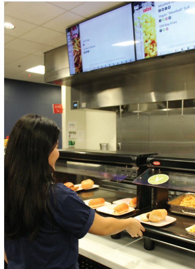
photo by Addie Porter Rice '26 reaches for a plate from the Smoke and Fire station in Burwell Dining Hall. Burwell has begun incorporating more themed dining experiences in its operations.