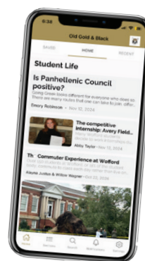
College News Source App

To read more online go to woffordogb.com or download the app College News Source now!